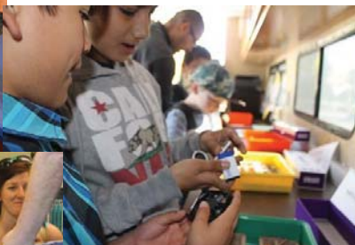
Circuit Building STEM Classes