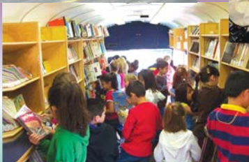
Summer Reading Programs