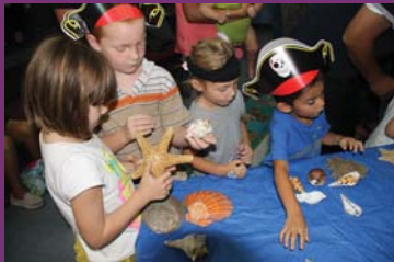
Cultural Arts Nights

The Foundation's fundraising efforts support the following programs and services, and much more!