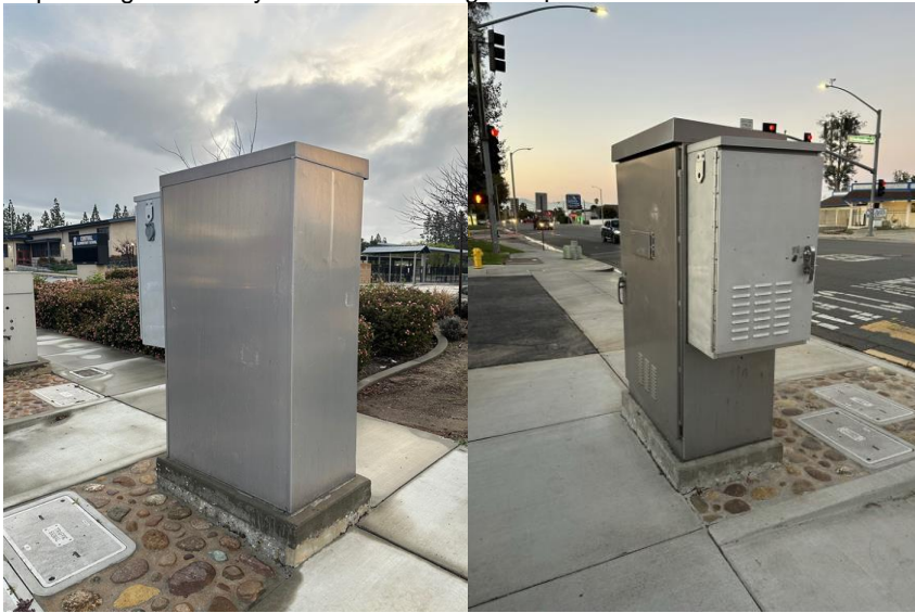
(sample front and back of a utility box)

Artist will be responsible for design elements on all four sides of the utility box including attached exterior cabinets. Below you will find a sample image of a utility box and the design template which is linked on the call for artist page.