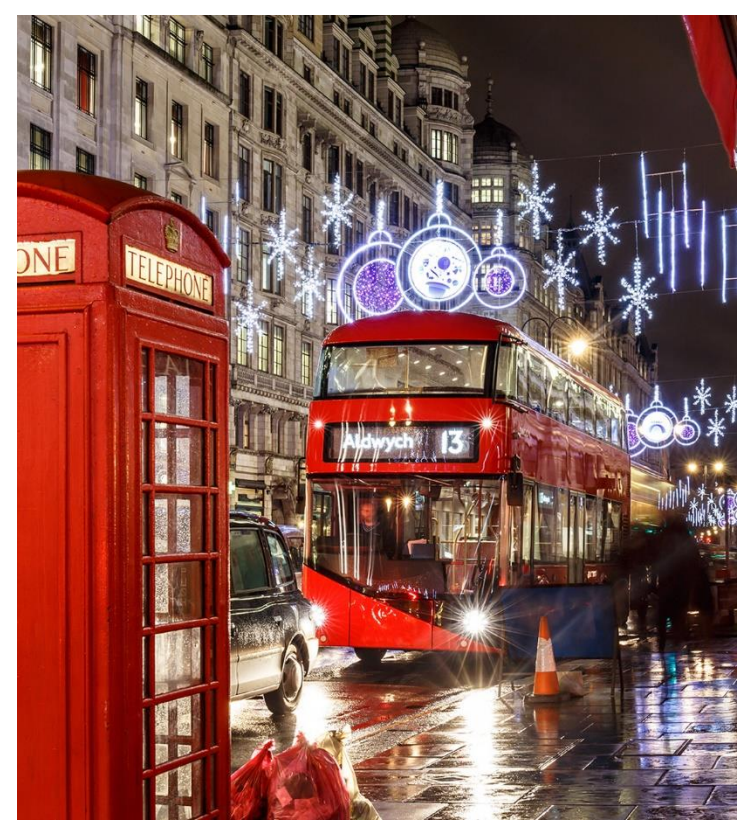
9 Days • 10 Meals: 7 Breakfasts, 3 Dinners

HIGHLIGHTS... Big Ben, Buckingham Palace, Oxford, Blenheim Palace, Eurostar Train, Arc de Triomphe, Galeries Lafayette, Choice on Tour, Eiffel Tower Dinner, Seine River Cruise